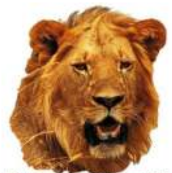
Afroleo, the legend in captivity