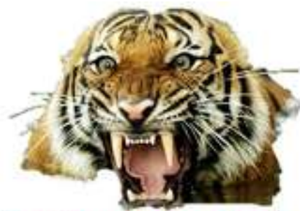
Royal Bengal Tiger (RBT) Garjon

RBT Garjon, a Royal Bengal Tiger (RBT) is alone on the stage. He is unlike others. RBT Gorjon happens to be the present Chief of the Jungles in the Asian Continent. He is always thoughtful but